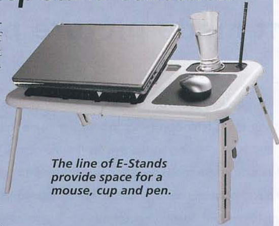
The line of E-Stands provide space for a mouse, cup and pen.

The Next Success’ initial assortment of laptop carts is priced from $29 to $49.